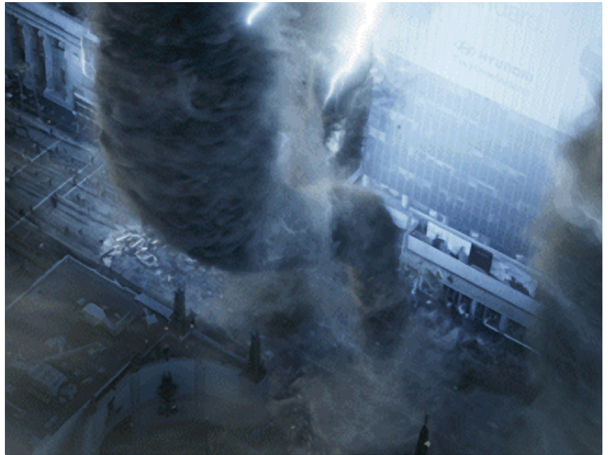
The Final Composite

their motion,” Hahn says. “We looked at tons of tornado references, though there’s very little on multi-spawn tornadoes. The interaction between tornadoes is a complex phenomenon, and sometimes they’re odd shapes. We decided to put a big hook on the tornado coming through the foreground and have it wipe through the frame.